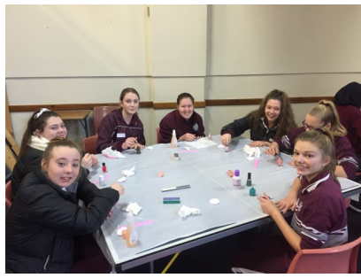
Figure 8 Program

Grade 8E enjoying 'Figure 8 Program', where the aim is to further develop students' social and emotional strengths. This is achieved through a team-building program which focuses on positive relationships and teams within Home Groups as well as developing individual confidence to empower girls to make good decisions and to appreciate their self-worth. #girlpower #beingawesome